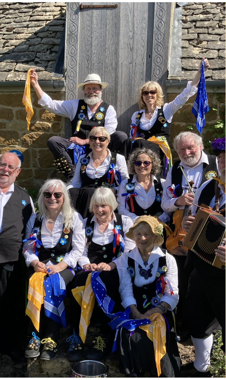
The Downs and Valley Parishes Magazine No. 18 Sept. 2024